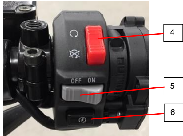
Controls – Right handlebar switches 4. Main power / emergency button 5. Driving sound forward on / off 6. Start/Stop button